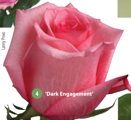
4 'Dark Engagement'